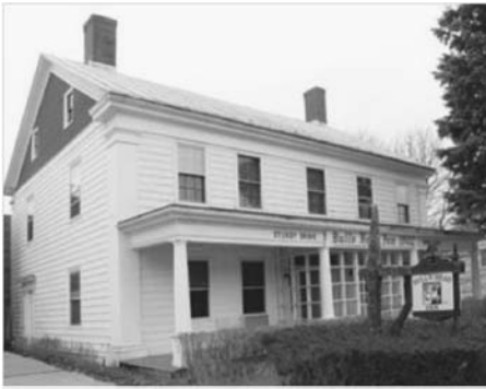
The current incarnation of the Bull's Head Inn.