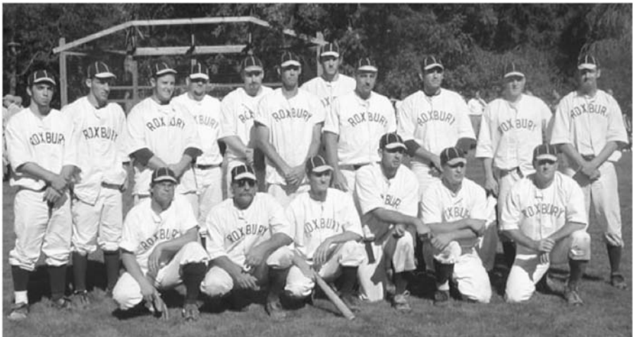
Roxbury's vintage baseball team poses for a group shot.

In some small towns, vintage baseball is still played. Roxbury does a lot of things for being such a small community, and one is legion baseball. Legion baseball is a baseball league that still plays vintage baseball. Participants dress up as old baseball players and play by the old rules. Many people from Roxbury participate in legion baseball, including many graduates of Roxbury High