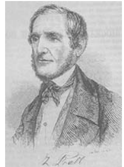
Portrait of Zadock Pratt

When they changed the house to the apartment buildings, they didn't change the rooms, they just rented out space. Then later the