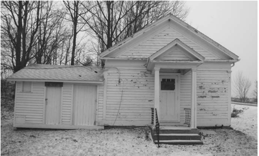
The Forks-in-the-Road Schoolhouse was the home of School District 7 in an earlier time, and served the families around Mayham Pond, Lumber Road, and South Gilboa Station.

Voted that the trustees be authorized to levy and collect a tax of Ten Dollars on the taxable Inhabitants of said District for the purpose of Supplying the School with