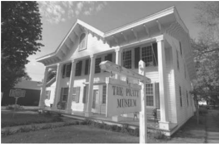
An outside shot of the Prattsville Museum.

house was turned into a museum. They didn't have to restore the building because they didn't change the rooms. In the museum today, you can see Zadock Pratt's furniture, a large portrait of Pratt, pictures of his two wives and carvings of his sons' signatures in the staircase and the window pane. Outside there is a well and a tree that was planted when Zadock Pratt moved in. The Pratt