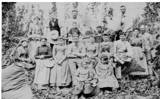
Hop Picking, Patrie Farm, Janesville, about 1895.