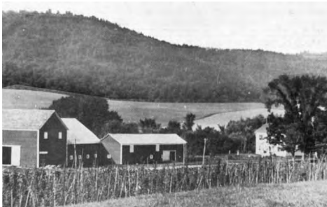
The Hynes Farm, Hyndsville, 1910.